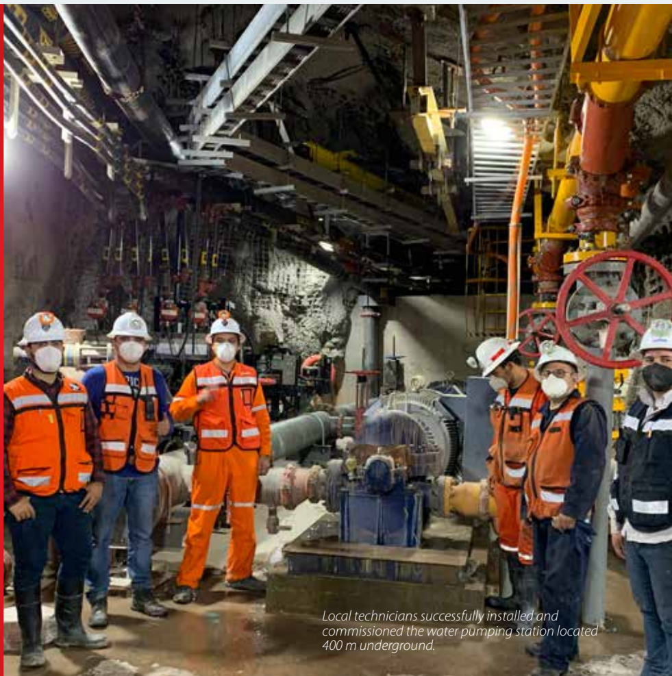
Local technicians successfully installed and commissioned the water pumping station located 400 m underground.

Installing an effective water pumping system became a multi-phase project. Firstly, the diagnosis was made following on-site visits, then evaluation and selection of solutions commenced. Finally, the solution was installed and commissioned. In each of the phases, Danfoss worked together with the solution integrator and business partner Autronic. Their combined talents formed a multidisciplinary technical and commercial team, which initiated a process of constant communication with users to analyze the various phases of the implementation of the solution.