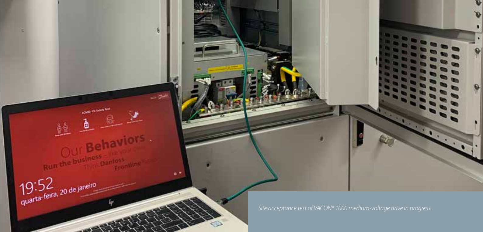
Site acceptance test of VACON® 1000 medium-voltage drive in progress.

VACON® 1000 is a general-purpose drive suitable for a wide range of medium voltage applications. It is easy to integrate into the main control systems and adapts quickly to the specific needs of each situation. This MV drive offers high environmental resistance to operate under harsh conditions, with high temperature, dust and humidity inside an electrical room.