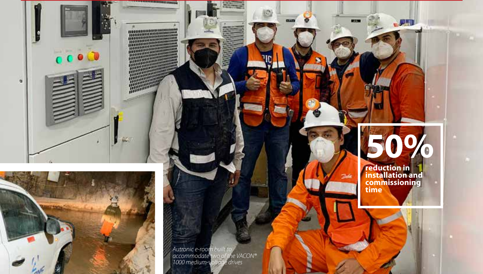
Autronic e-room built to accommodate two of the VACON® 1000 medium-voltage drives